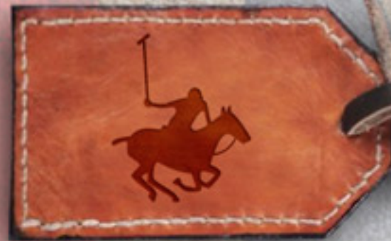
TAGS Y BADANAS